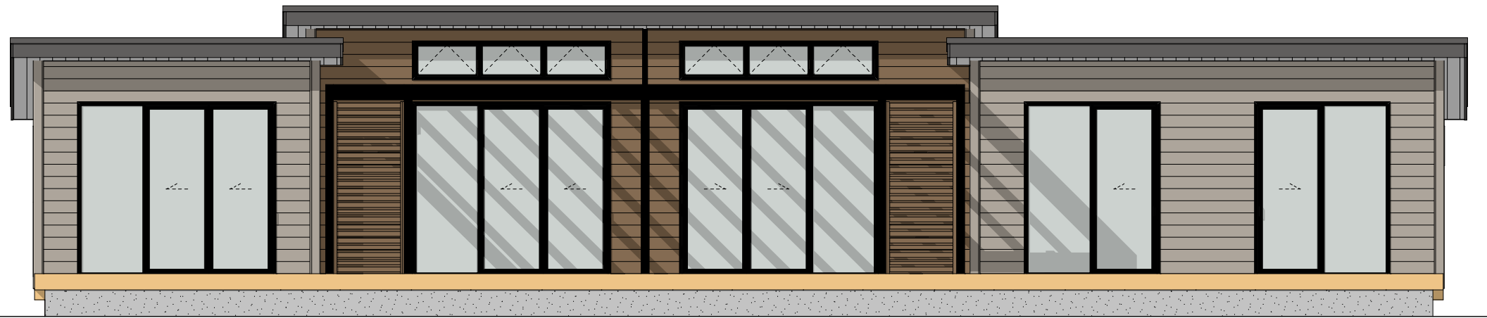
Elevation A 1:75