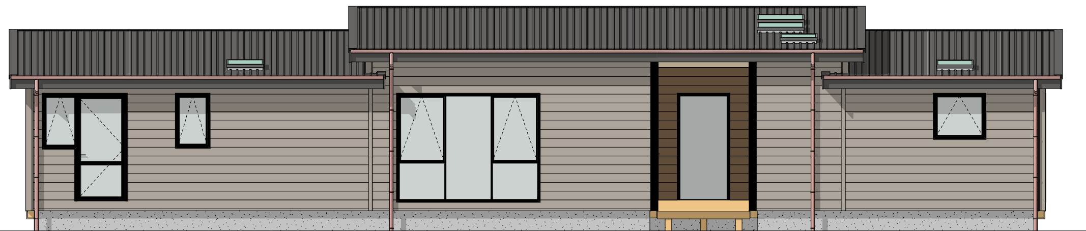
Elevation C 1:75