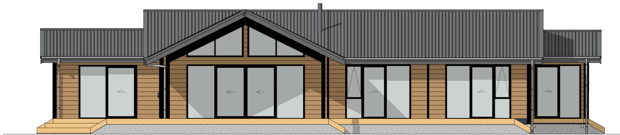
Elevation A 1:75