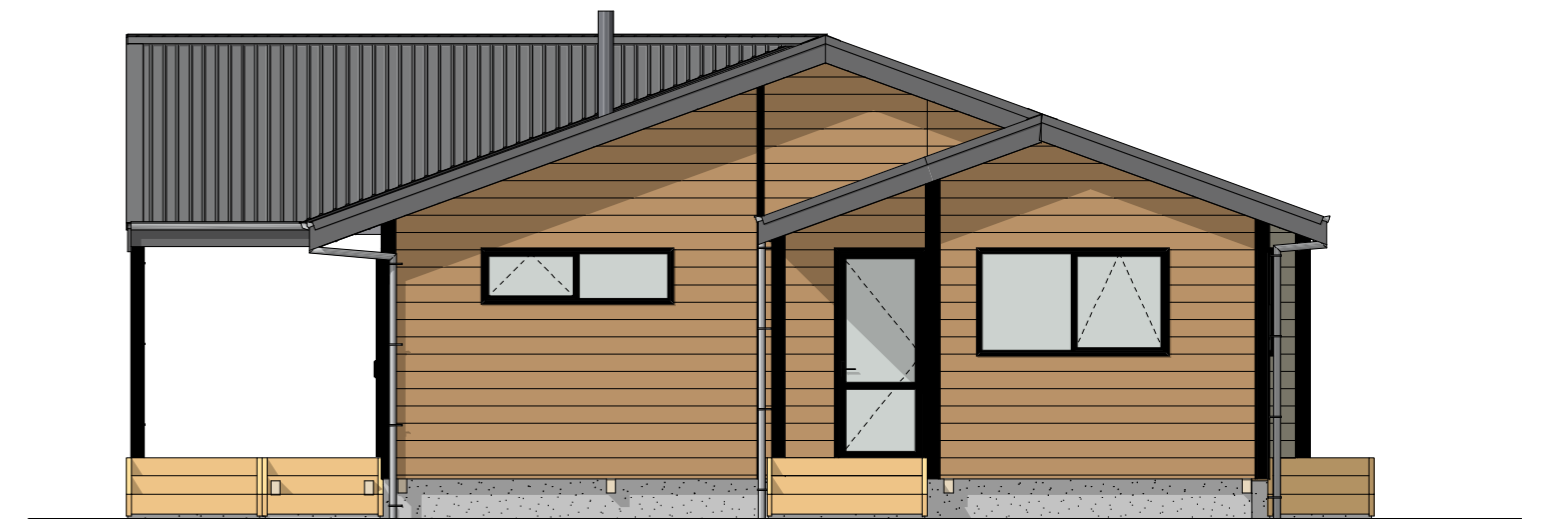
Elevation D 1:75