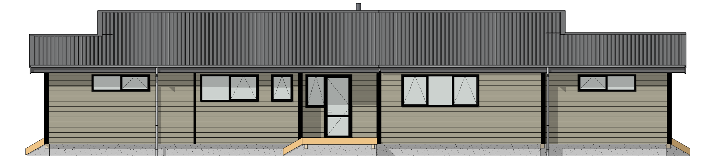
Elevation C 1:75