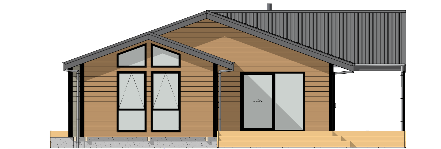
Elevation B 1:75