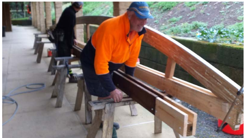
^The beams were made in stages, using moulds and clamps