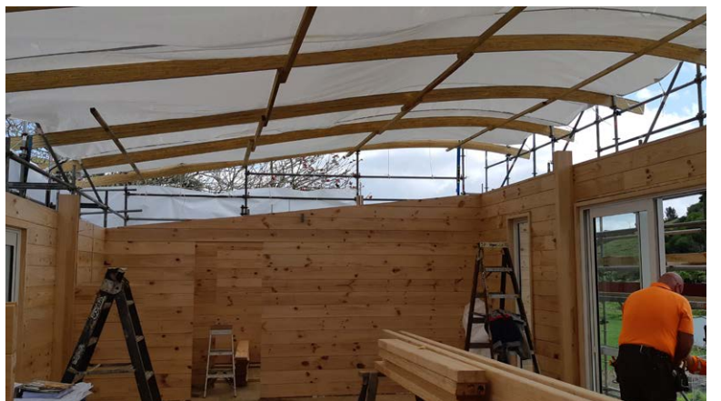
^A reusable and ventilated shelter is created above the build