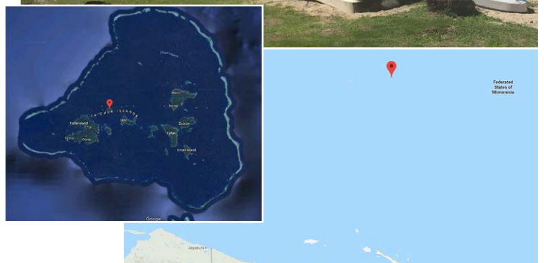
This one bedroom Lockwood cottage is located on the tiny island of Romanum