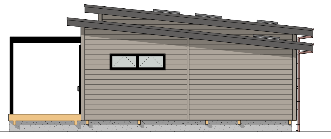
Elevation D 1:75