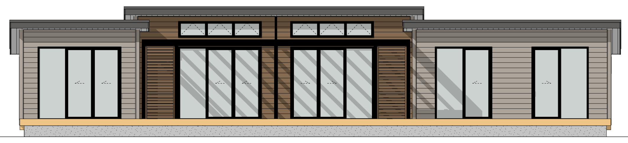
Elevation A 1:75